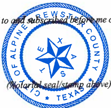
(Notarial seal/stamp above)

SWORN to and subscribed before me on this, the 20th day of JUNE , 20 23