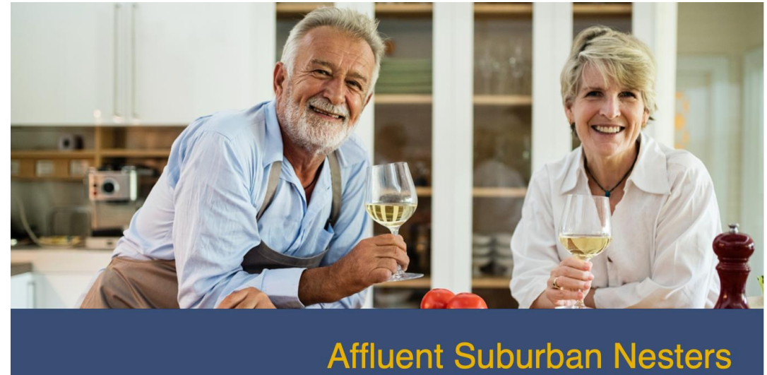
Affluent Suburban Nesters

Will be rightly cautious to resume traveling