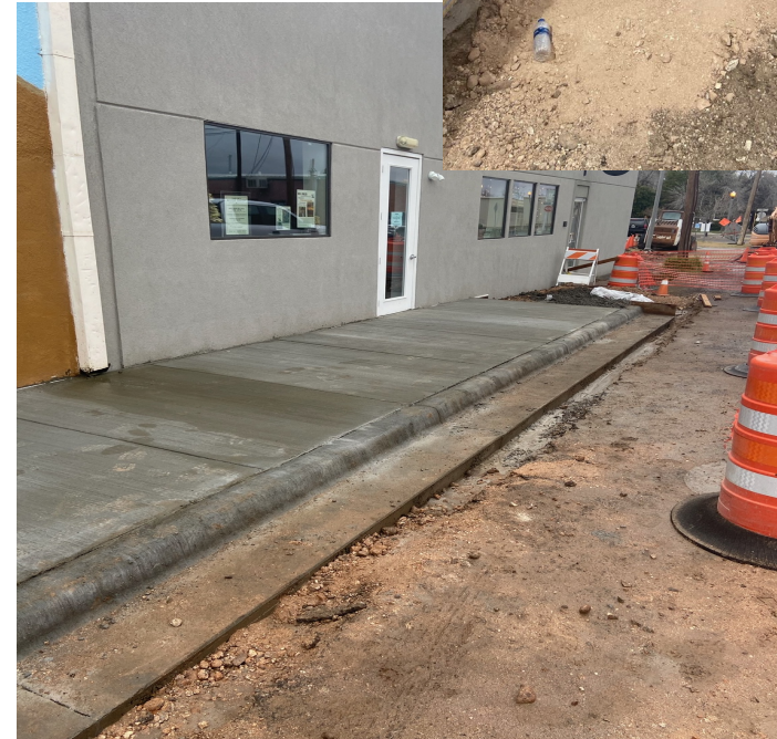
Fourth Street and Holland