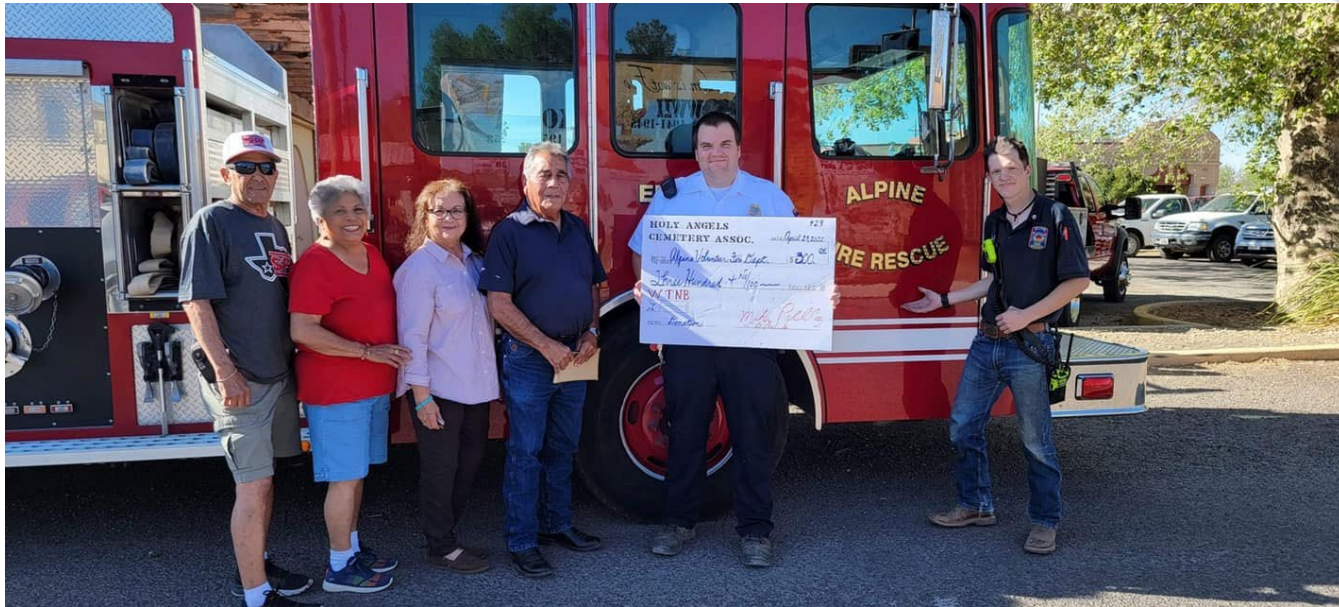
Holy Angels Cemetery Association