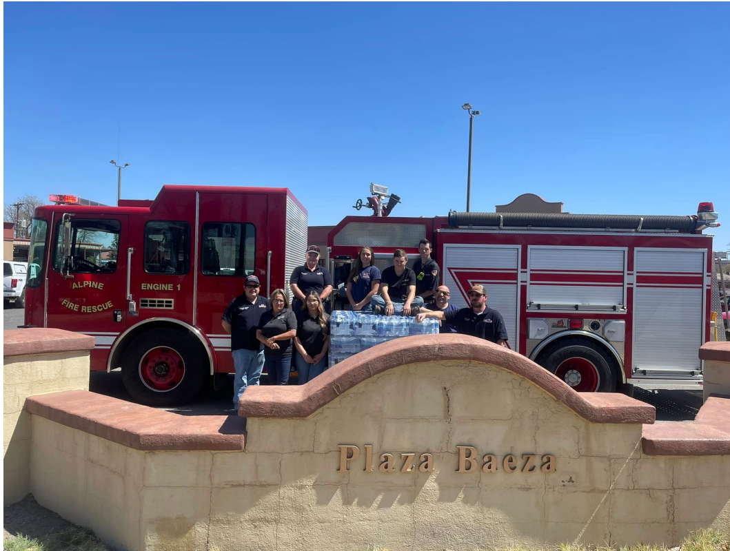
Porters donations of water pallet