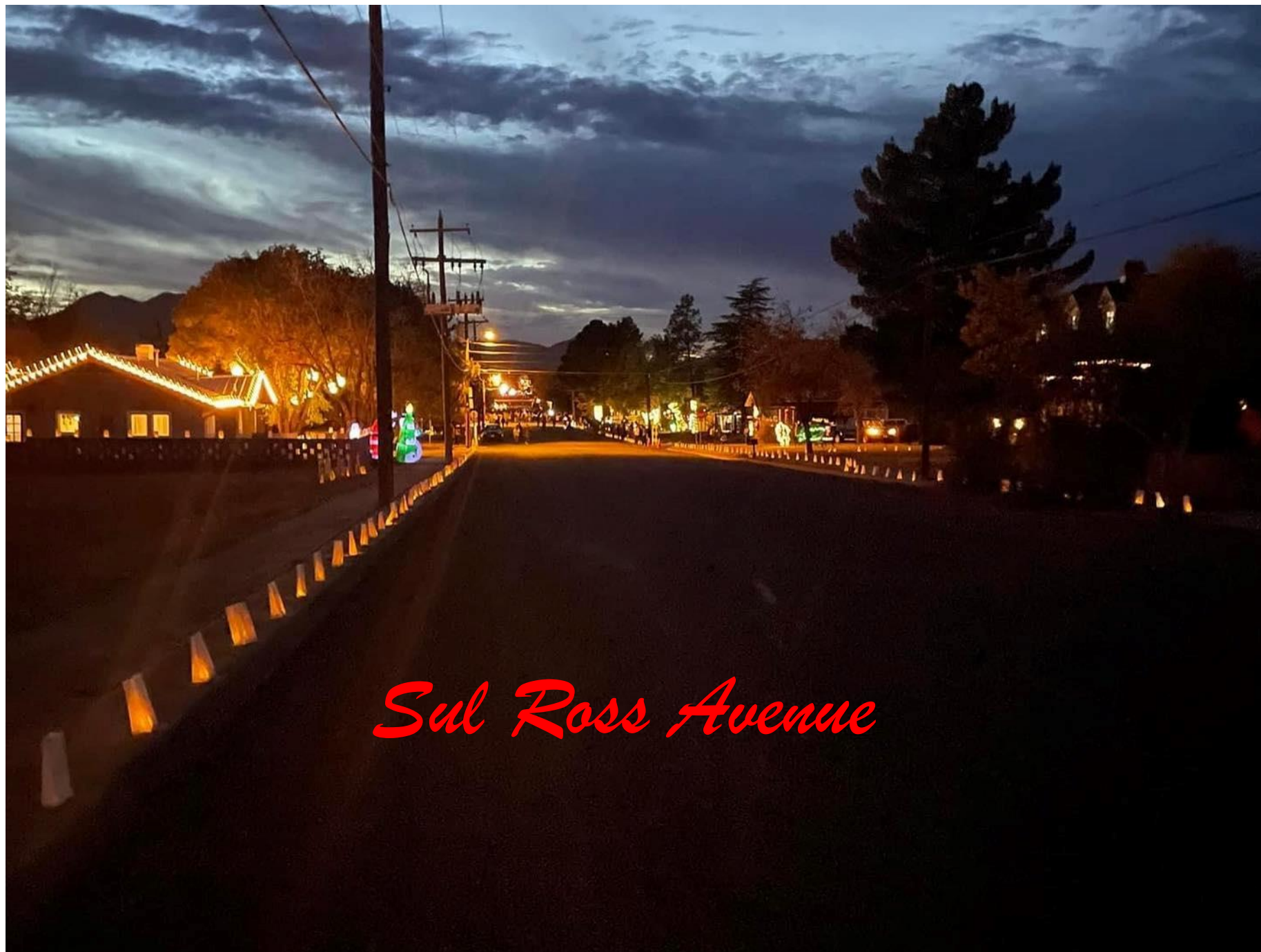
Sul Ross Avenue