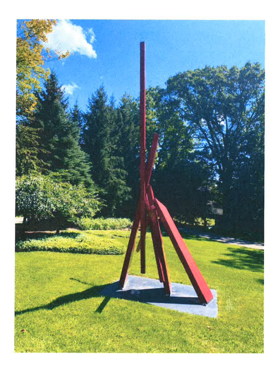
Sent from my iPad