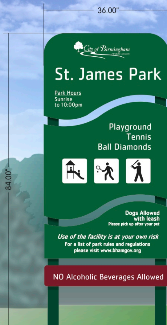
Color Option A