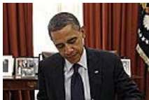
Homeowners May Be In