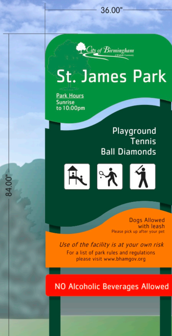
Color Option B