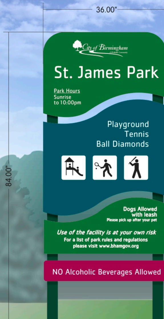
Color Option D