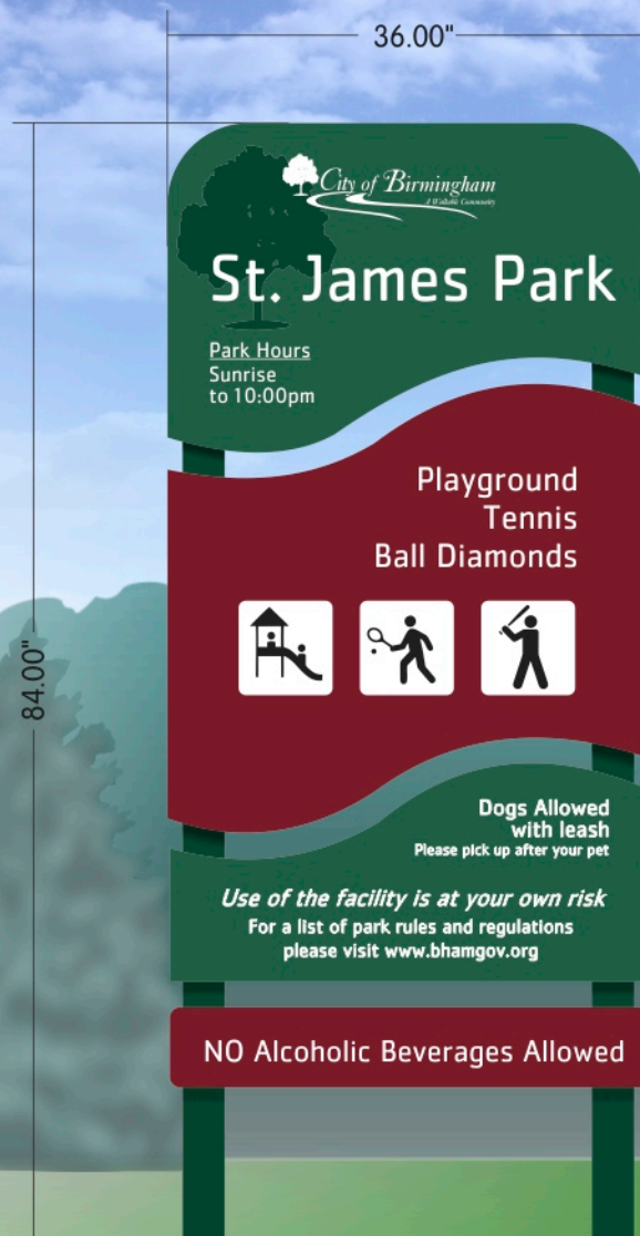
Color Option C