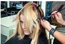
Why Stylists Hate