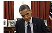
Homeowners May Be In for a Rude Awake... Smart Life Weekly