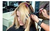
Why Stylists Hate Boxed Haircolor Hair Color For Women