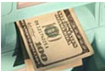
10 Bad Spending

Observer & Eccentric Newspapers 615 West Lafayette - Second Level Detroit, MI 48226 Call Us: (866) 887-2737 Classifieds: 1-800-579-7355 STAFF | EMAIL US