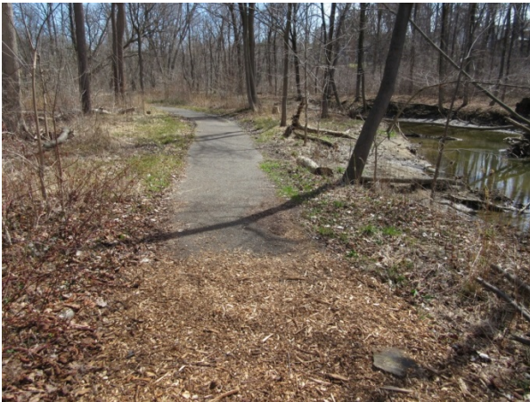
Booth Park Trail After