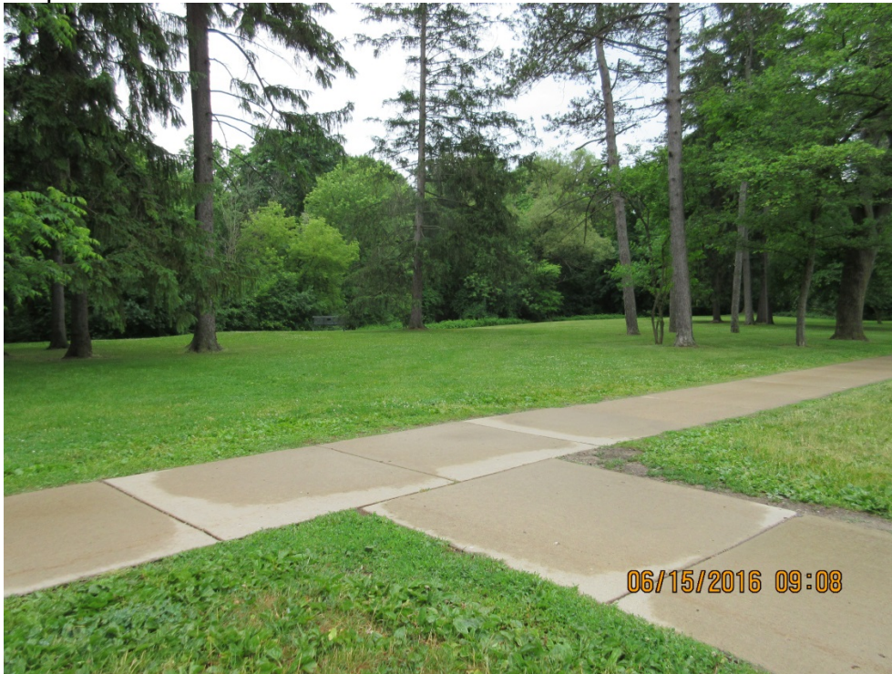
Proposed Location for Porous Pave