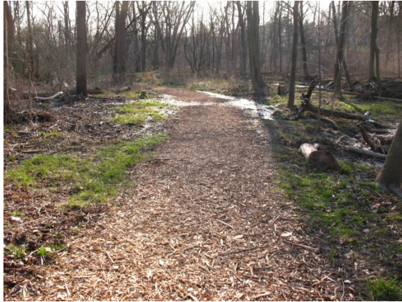
Booth Park Trail Before