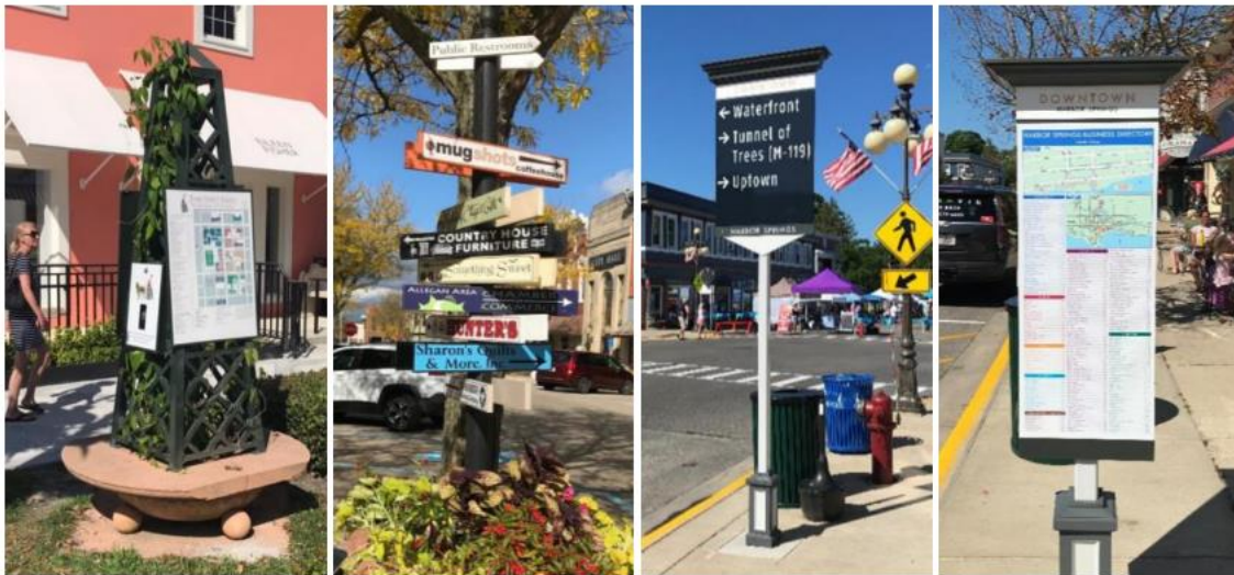
Wayfinding signage above left -right: Naples, FL; Allegan, MI; Harbor Springs, MI

Below wayfinding examples for the committee's reference.