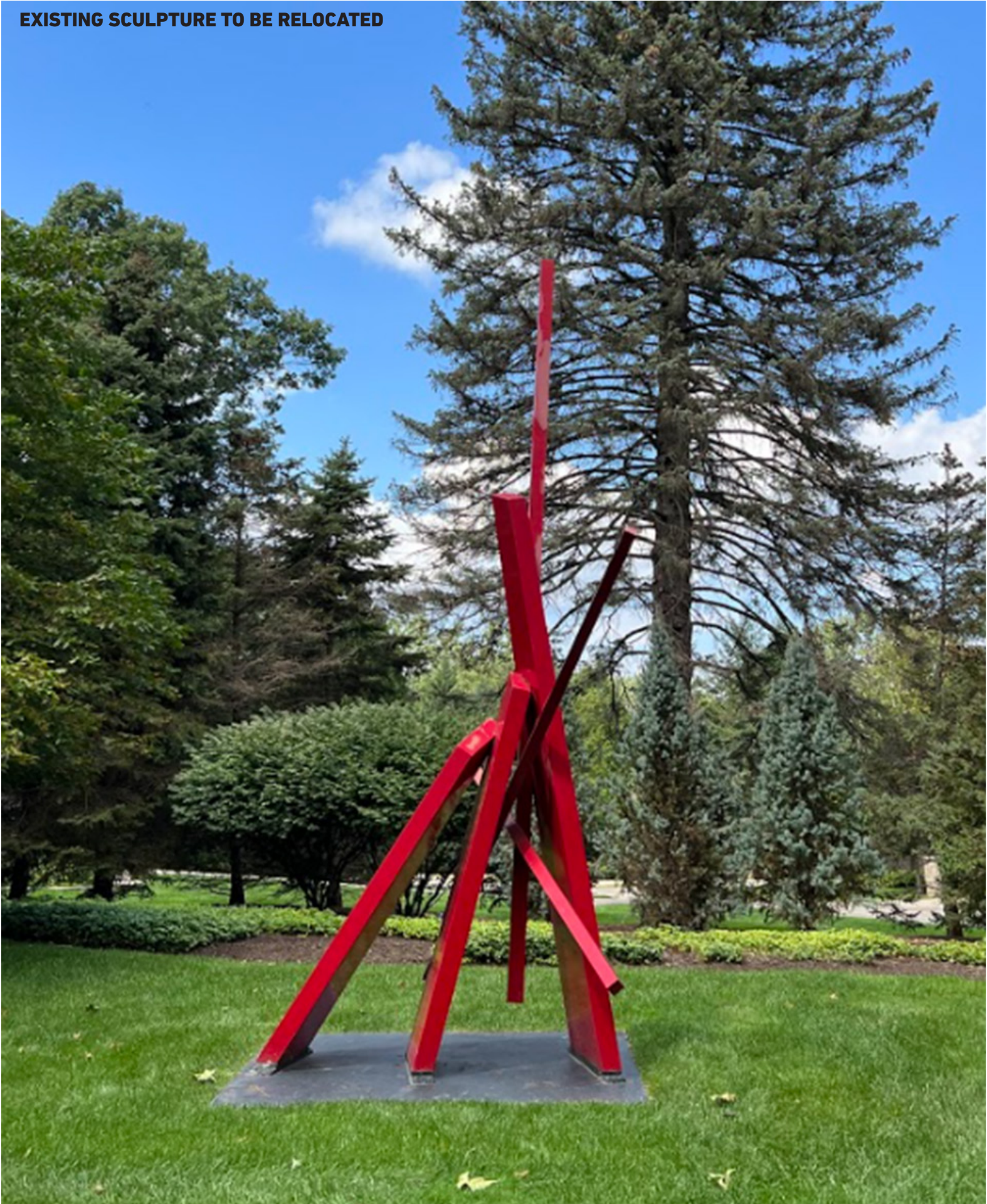
EXISTING SCULPTURE TO BE RELOCATED