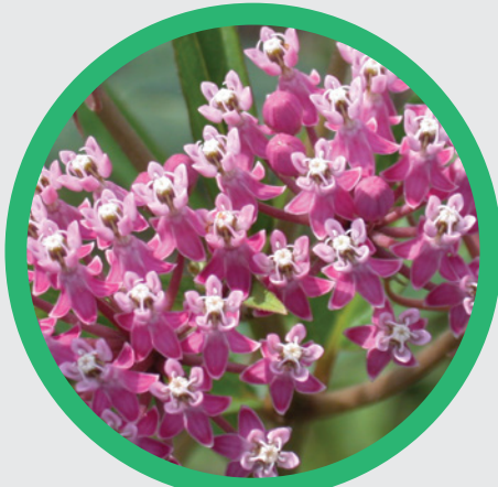
Swamp Milkweed Asclepias incarnata