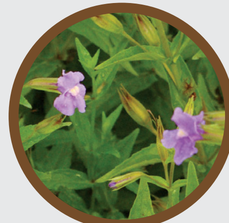
Monkey Flower Mimulus ringens