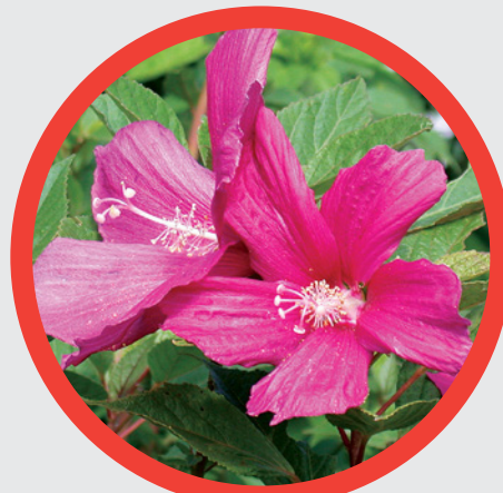
Rose Mallow Hibiscus moschuetos