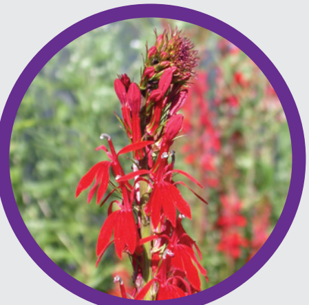
Cardinal Flower Lobelia cardinalis