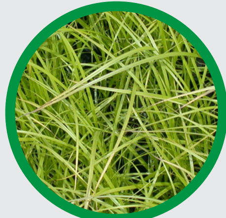
Fox Sedge Carex vulpinoidea