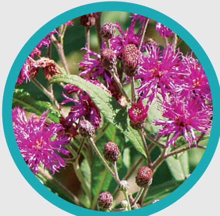
Common Ironweed Vernonia fasciculata