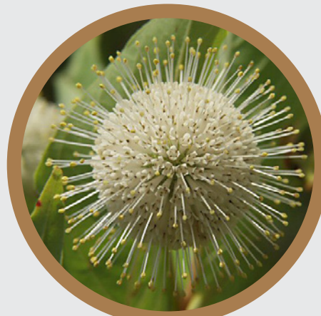
Buttonbush Cephalanthus occidentalis