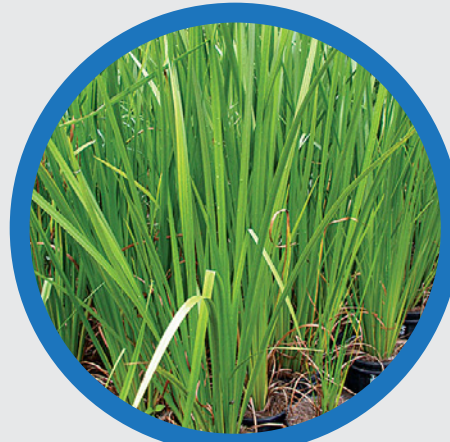
Sweet Flag Acorus gramineus