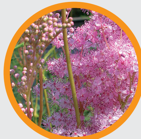
Queen of the Prairie Filipendula rubra