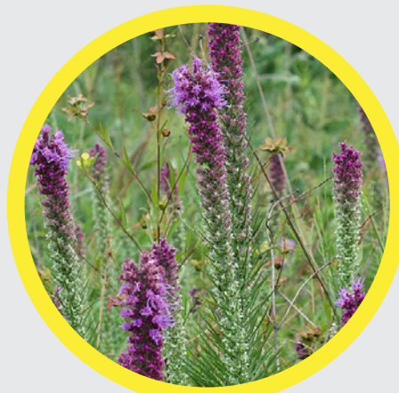
Marsh Blazing Star Liatris spicata