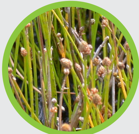
Blunt Spikerush Eleocharis obtusa