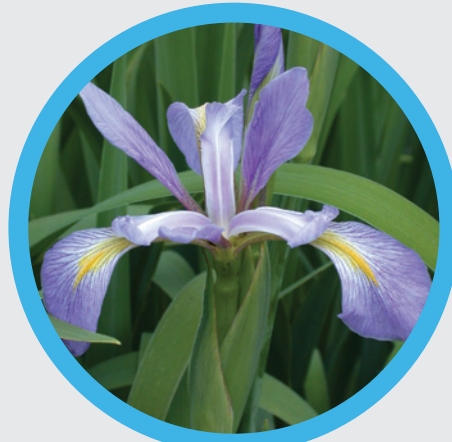
Blue Flag Iris Iris versicolor