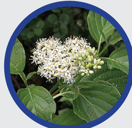
Red Twig Dogwood Cornus sericea