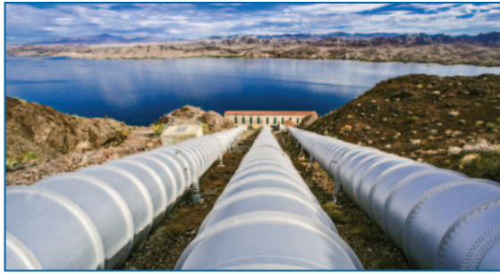
Whitsett Intake Pumping Plant on the Colorado River.

Orange County's water supplies are a blend of groundwater managed by OCWD and water imported from Northern California and the Colorado River by the Municipal Water District of Orange County (MWDOC) via MWDSC. Groundwater comes from a natural underground aquifer that is replenished with water from the Santa Ana River, local rainfall and imported water. The groundwater basin is 350 square miles and lies beneath north and central Orange County from Irvine to the Los Angeles County border and from Yorba Linda to the Pacific Ocean. More than 20 cities and retail water districts draw from the basin to provide water to homes and businesses.