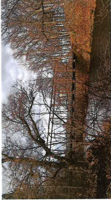
View from west side of Kinderhook Creek