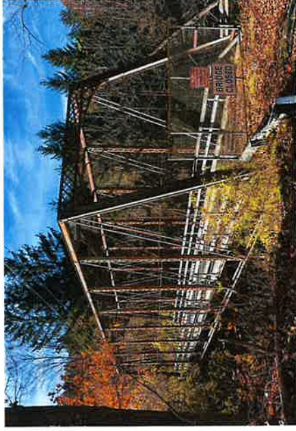
View from east side of Kinderhook Creek