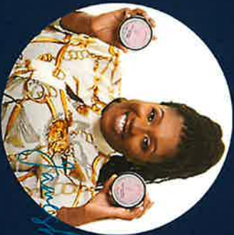
Owner, JC Beauty