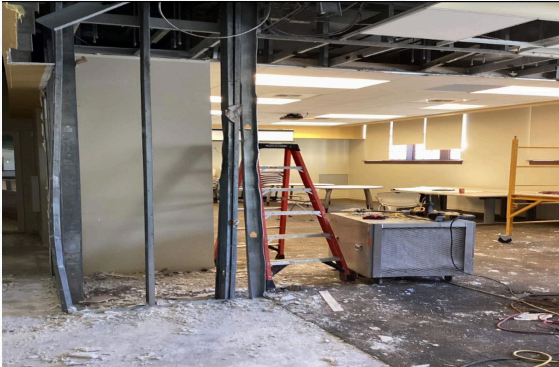
Meeting room demo to prep for the addition of storage space and study rooms.