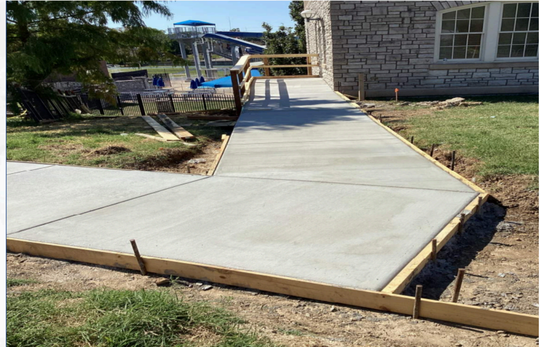
New walkway on the east side of the building for a safer curbside service experience. This is the first of our new walkways!