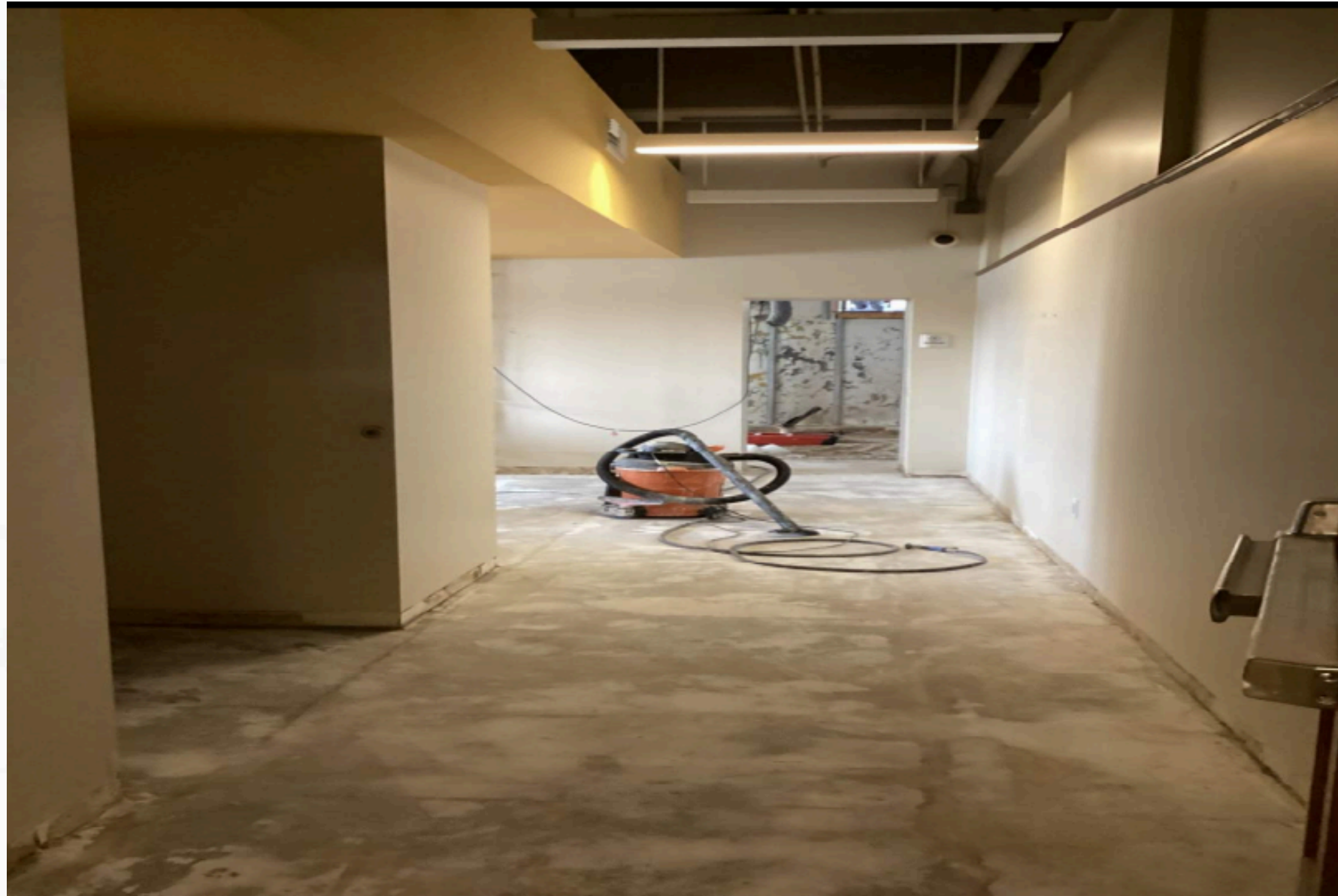
Lower-level hallway being prepped for the addition of study rooms.