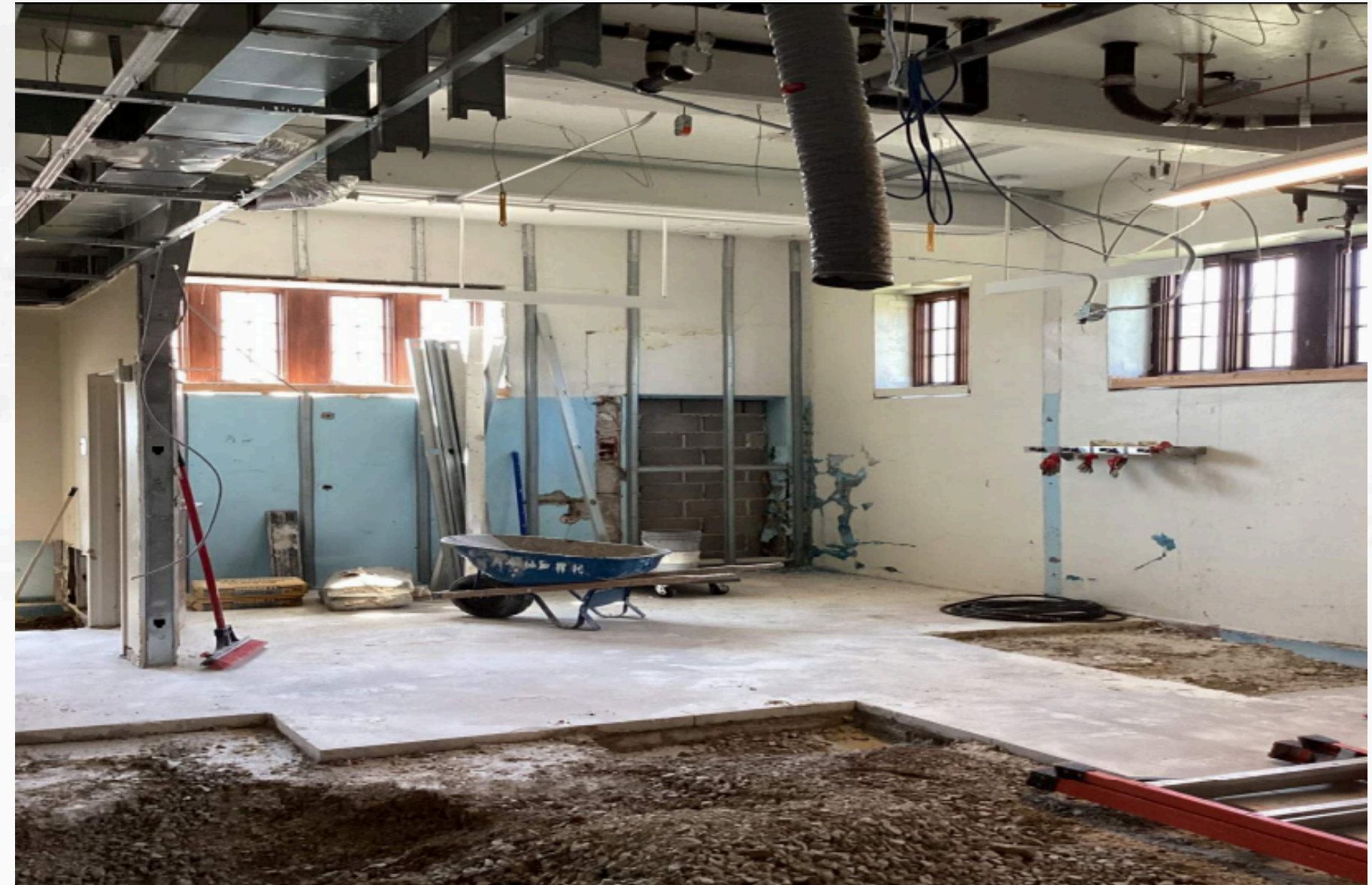
All walls have been removed from lower-level west corner to expand Local History Room and create gender neutral and family restrooms.