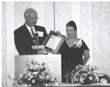
2004 RPC Hosts the 40th Annual OCCD Summer Conference