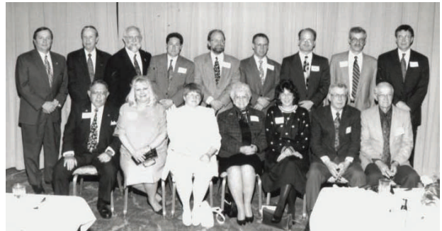
Former staff members came back for the celebration.