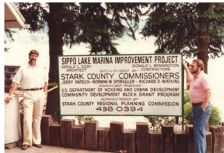
1985 Sippo Lake Marina Improvement Project Financed through CDBG Program