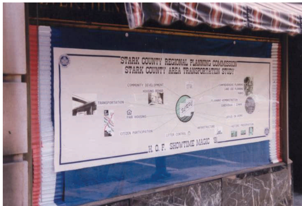
Displays we did to cover up the windows of the old County Office Building during Hall of Fame week.