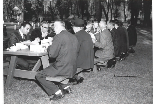
1966 RPC Members Tour of Canal Lands

Made application to create a park district