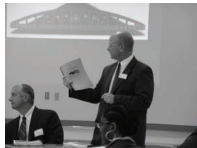
Sept. 2006 SCRPC/SCATS teams up with ODOT and Ohio Department of Public safety for the Roadway safety Workshop