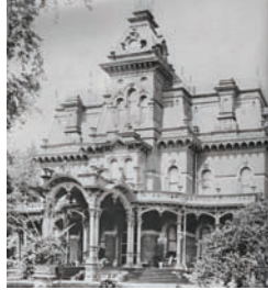
the Harter Estate.