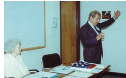
Ralph Regula at RPC Open House May 7, 1993