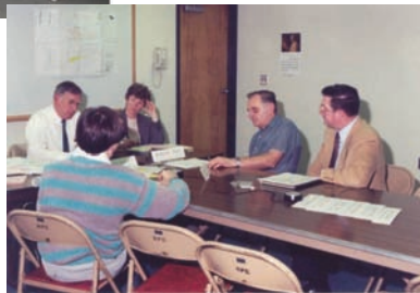
Subdivision Review Subcommittee meeting