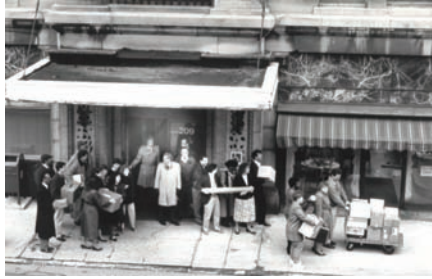
1992 RPC moves from the old County Office Building (demolished) to present location 201 3rd St . NE