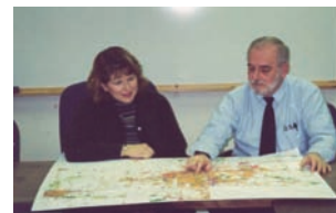
Land Use Planning