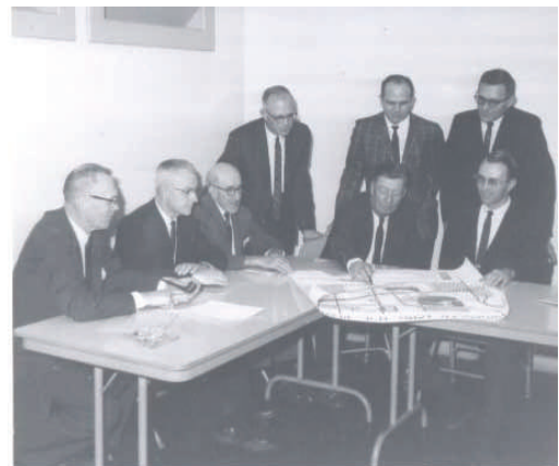
Commission Members at work 1966 meeting

1967 updated 1962 Shopping center survey.