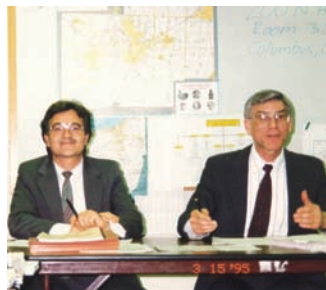
FHWA/FTA Citizens Seesion RPC conference room